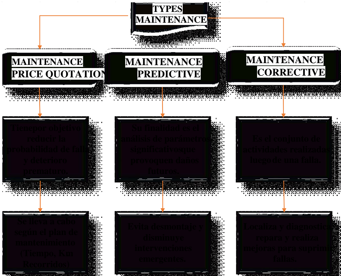
Graph.1 Types of maintenance

NPS = 85.15% , for the month of September 2018.