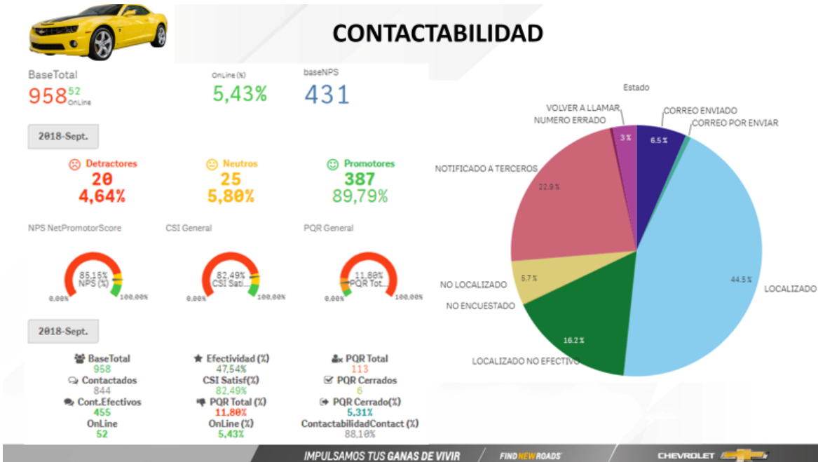
Graph.3 Data of NPS, CSI and PQR in the month of September 2018